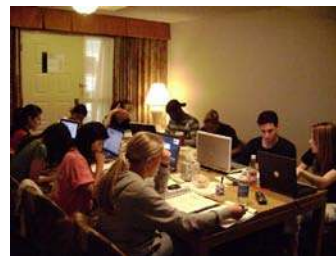
GMAT TURBOPREP CLASS IN DALLAS

(Read more about why Other courses are not a patch on MLIC GMAT prep on pages 8 to 13 in this brochure)