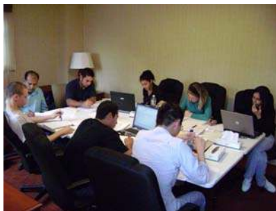
TURBOPREP® CLASS IN NYC