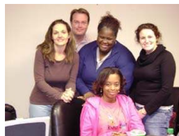
GMAT TURBOPREP GROUP ATLANTA