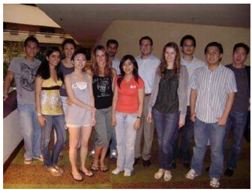
GMAT TURBOPREP CLASS IN SINGAPORE

Be informed and be smart -- Choose MLIC GMAT prep courses that offer full-time MBA instructors who proactively coaches you in GMAT-critical areas, and backs up its training with industry-leading GMAT Score Guarantee™ MLIC trains more people per month in the major markets than any other company. Kaplan, Princeton Review, Manhattan GMAT, Veritas Prep, Testmasters, and others.