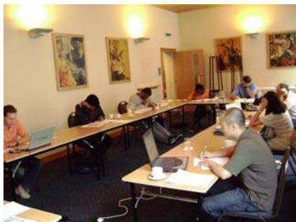
TURBOPREP® CLASS IN LONDON

You can also register by calling us at +1 212 682 5000 / +44 (0) 208 123 5060, or toll-free at 1 888 565 GMAT (USA/ CANADA only)